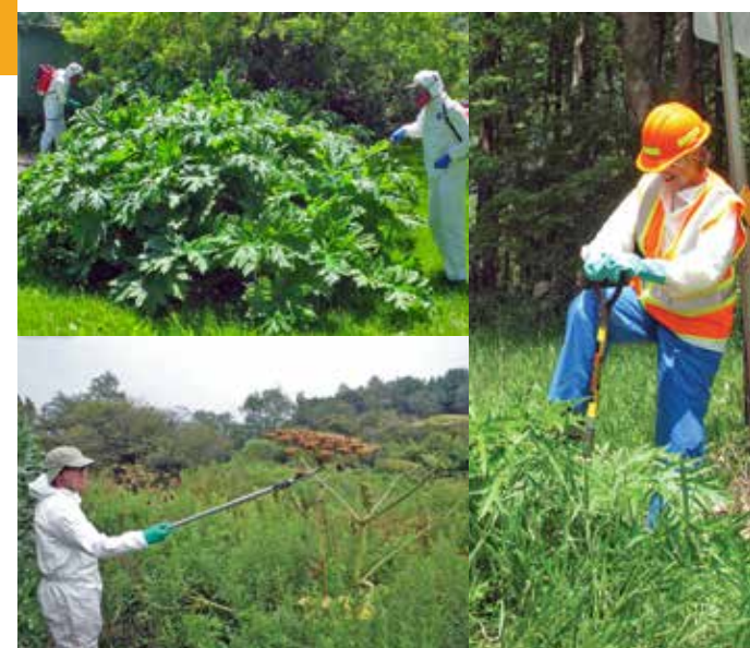
DEC workers conducting hogweed control

See more precautions at www.dec.ny.gov/animals/72556.html