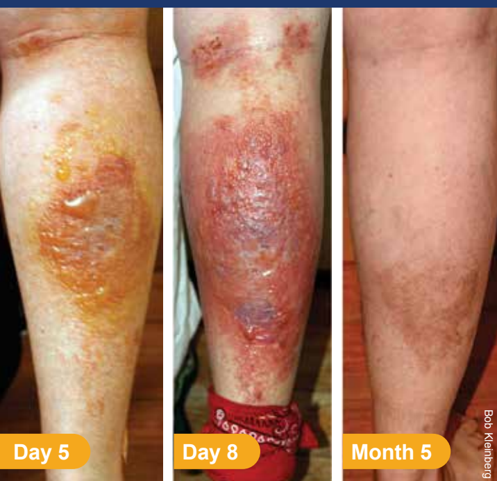
Skin burned and scarred by giant hogweed sap

Giant hogweed was brought to North America from the Caucasus region of Eurasia as a garden plant in the early 1900s, but escaped cultivation. It spreads quickly, especially along roads and streams, taking over untended land, crowding out other plants and causing soil erosion. NYS law prohibits possession of giant hogweed with the intent to sell, import, purchase, transport, introduce or propagate.